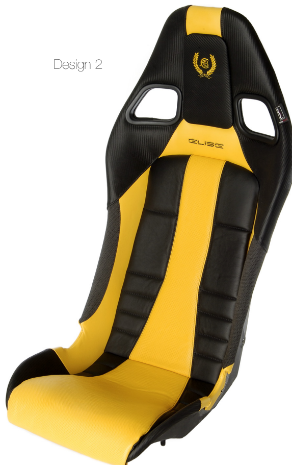
Carbon effect and plain leather outers with plain leather centres and perforated leather centre strip