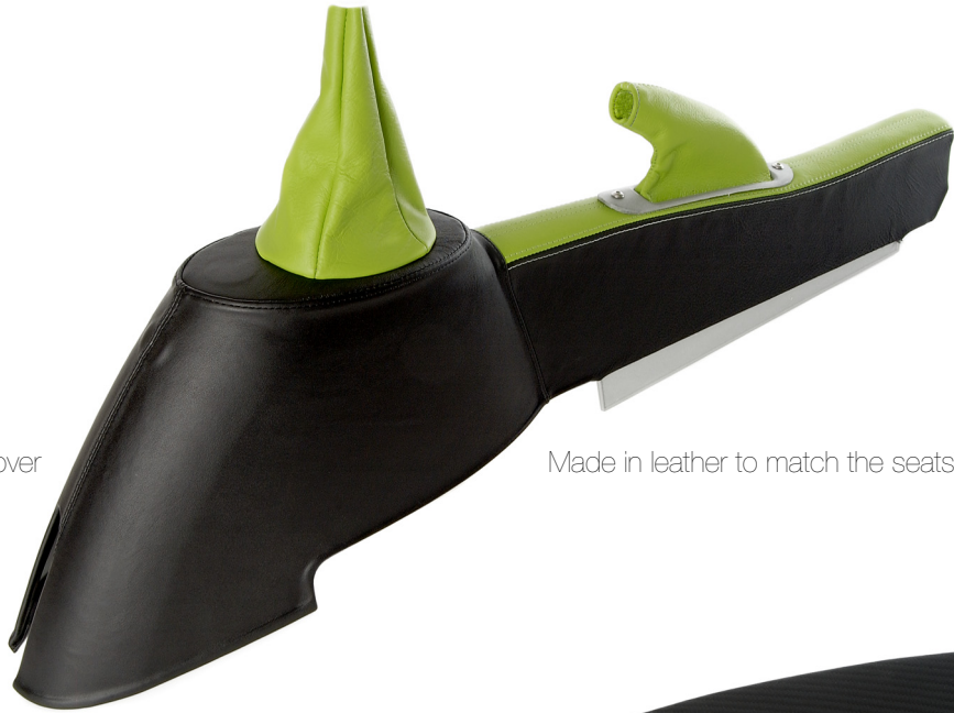
Made in leather to match the seats*