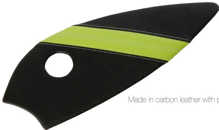
Made in carbon leather with plain leather stripe