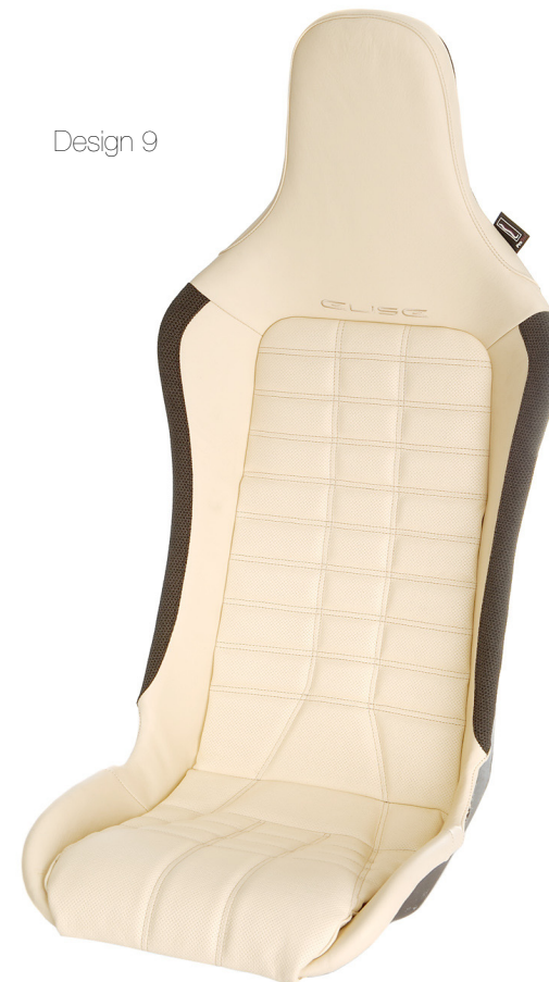
Plain leather outers with perforated leather centres