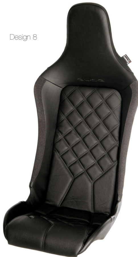
Plain leather outers with perforated leather centres